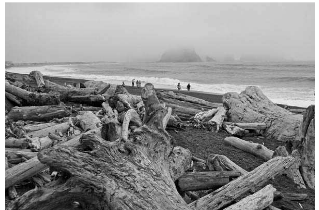
Gray Day at Rialto Beach Tom Andre