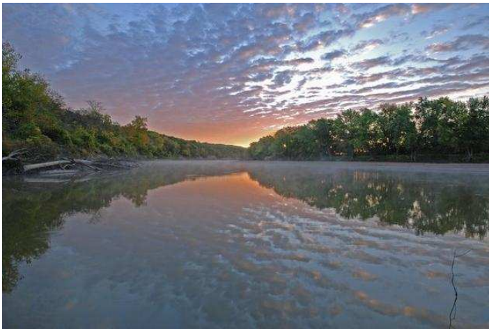
Sunset Over River

Congratulations to all the winners and thanks to all who participated in the contest. The above pictures can all be viewed on the club website's history page.